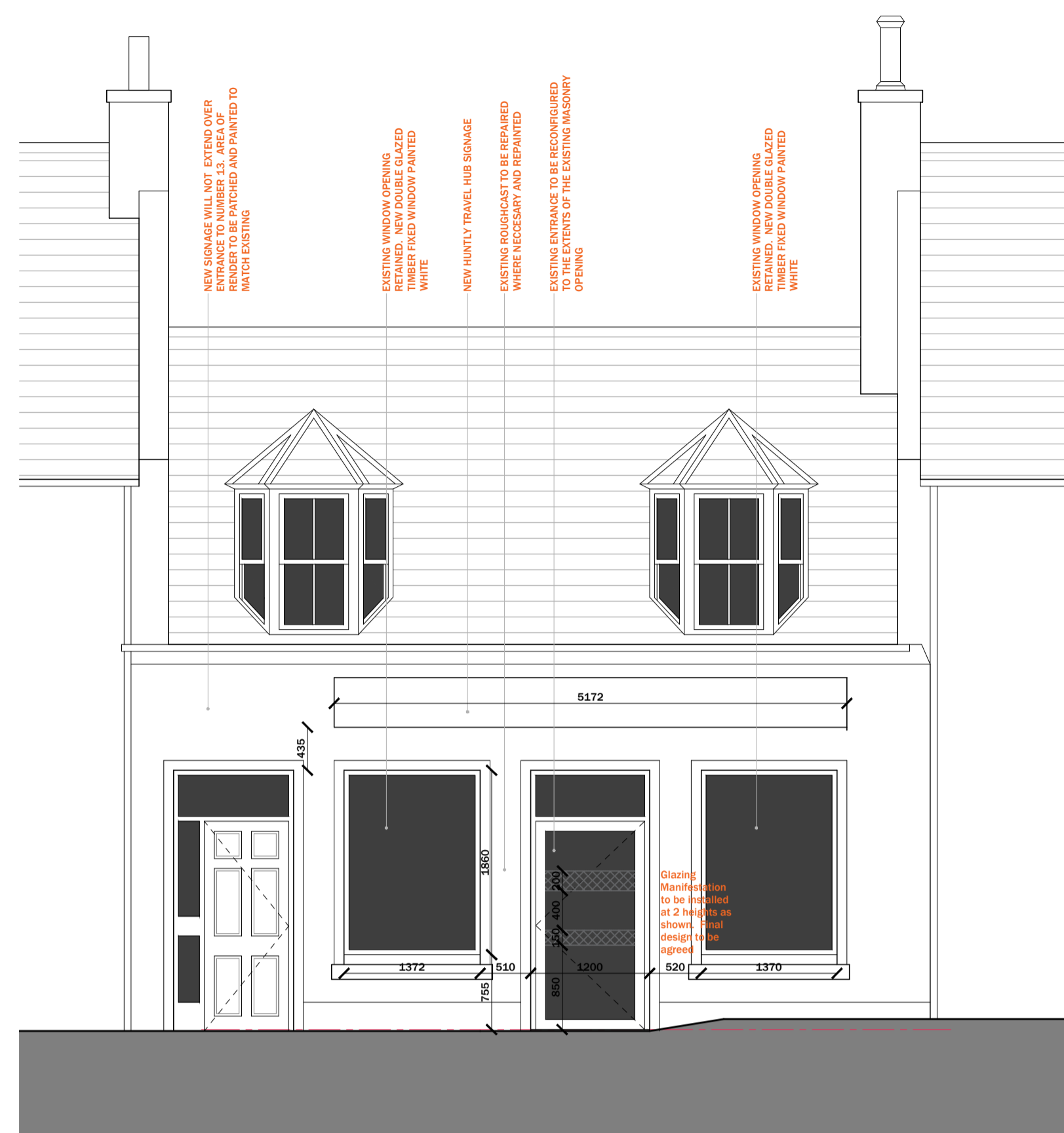
PROPOSED SOUTH ELEVATION 1:50 @ A1 (Deveron Street)